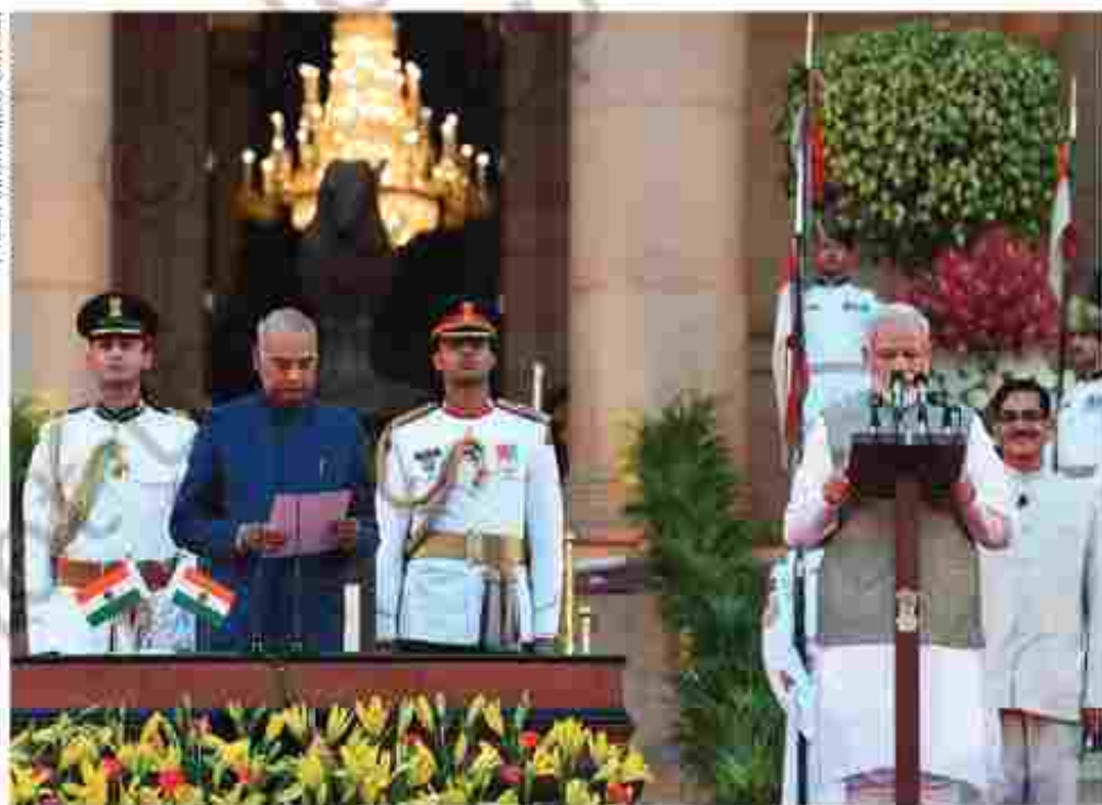
The President, Smt. Droupadi Murmu administering the oath of office of the Prime Minister to Shri Narendra Modi, at a Swaying-in Ceremony, at Rashtrapati Bhavan on 30 May 2019.